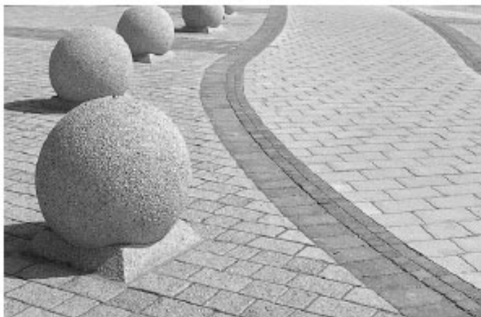
Figure 4. Light colored paving units reflect light and help reduce micro-climatic temperatures.

regularly. Grids and grass will provide heat reducing benefits for these areas. Areas with regular parking should be paved with PICP.