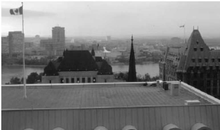
Figure 5. Light colored paving on low-slope roofs reflects light saving on air-conditioning costs while protecting the waterproofing.