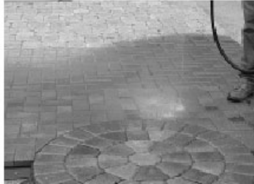
Figure 7. Dry-applied joint sand with a stabilizer is wetted in order to activate it and stiffen the sand. Once the joints dry, they are stabilized.