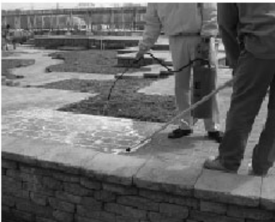
Figure 3. This liquid joint sand stabilizer is applied with a low-pressure sprayer and squeegeed across the surface after allowing some time for soaking into the joints. This helps maintain slip and skid resistance of the paver surface.

Stabilizer and sealers are two distinct products sometimes with overlapping functions. Joint sand stabilizers help secure sand in the joint after it has been installed. Their primary function reduces the risk of removal of joint sand from flowing water, wind, aggressive cleaning, tire action and intrusion of organic matter, seeds and ants. Joint sand stabilizers come in liquid and dry applied forms. Some liquid stabilizers are made of the same materials as sealers, but with a higher solids content with additional wetting agents. When applied to the paver surface and joints, stabilizers can make the surface easier to clean and prevent staining in a manner similar to sealers. Depending on the chemical contents, liquid stabilizers may or may not change the appearance of the paver surface. All surface sealers are applied as liquids. Their primary function is providing additional protection to concrete paver surfaces. Such chemicals can be similar to products used to seal cast-in-place concrete slabs. Sealers are applied to the entire surface of an installation to add further protection from stains, oils, dirt, or water. Occasionally, sealers are applied to pavers during manufacturing. Whether applied in a factory or on a site, most sealers change the appearance of the paver surface by darkening it and enhancing the surface color. Since liquid sealers penetrate the joint sand to some extent during application, they secondarily provide some stabilization.