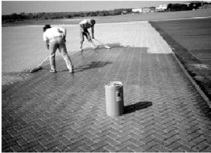
Figure 10. Urethane is applied with squeegees to stabilize joint sand between pavers on aircraft pavement.