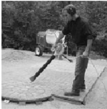
Figure 6. Whether using liquid or dry joint stabilization materials, the surface of the pavers should be cleaned with a blower or broom after the joint sand is compacted into the joints.