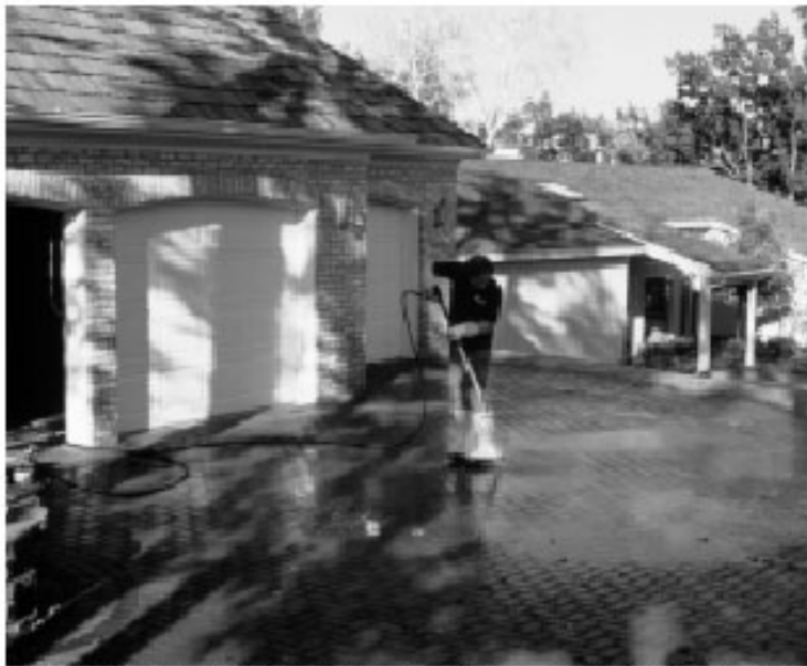
Figure 2. Pressurized cleaning equipment used by professional cleaning and sealing companies can bring out the best appearance from pavers.