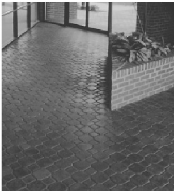
Figure 1. Many sealers enhance the appearance of concrete pavers and protect against staining.

When properly installed, interlocking concrete pavements have very low maintenance and provide an attractive surface for decades. Under foot and vehicular traffic, they can become exposed to dirt, stains and wear. This is common to all pavements. This technical bulletin addresses various steps to ensure the durability of interlocking concrete pavements and to help restore their original appearance. These steps include removing stains and cleaning, plus joint stabilization or sealing if required. Stains on specific areas should be removed first. A cleaner should be used next to remove any efflorescence and dirt from the entire pavement. A newly cleaned pavement can be an opportune time to apply joint sand stabilizers or seal it. In order to achieve maximum results, use stain removers, cleaners, joint sand stabilizers, and sealers specifically for concrete pavers. These may be purchased from a manufacturer, contractor, dealer or associate member of the Interlocking Concrete Pavement Institute.