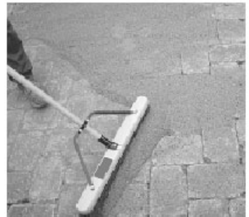
Figure 5. Joint sand can be pre-mixed and delivered to the site (typically in bags), or mixed with stabilizer at the site, then swept into the joints, compacted for consolidation in them to create interlock, and wetted to activate the stabilizer.