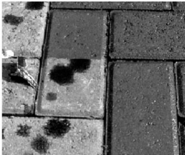
Figure 9. Sealers resist stains which makes them ideal for high use areas where they might occur.