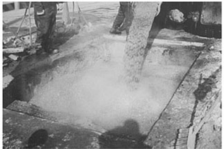
Figure 11. Low density concrete fill (unshrinkable fill) poured into a utility trench from a ready-mix concrete truck.