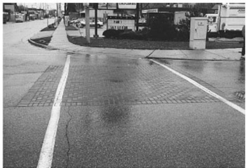
Figure 13. Concrete pavers in utility cuts can be painted as any other pavement.