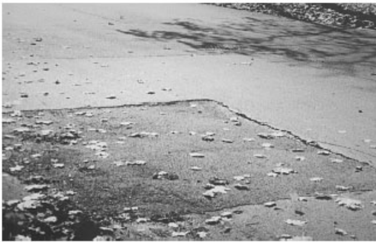
Figure 7. Pavement damage from settlement and shrinkage of cold patch asphalt.