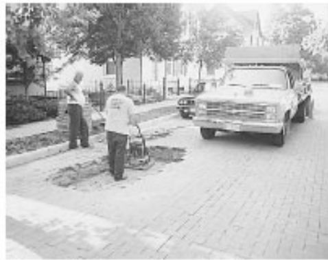
Figure 3. Compaction of the base.