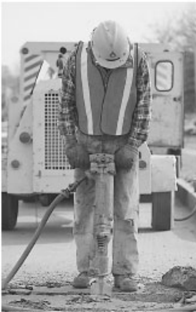
Figure 1. Repairs to utilities are a common sight in cities, incurring costs to cities and taxpayers.