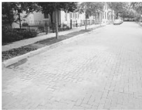
Figure 5. The final paver surface is continuous. There are no cuts or damage to the pavement.