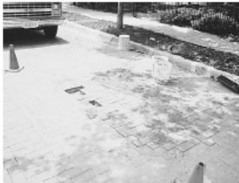
Figure 4. Reinstatement of the pavers, bedding and joint sand.