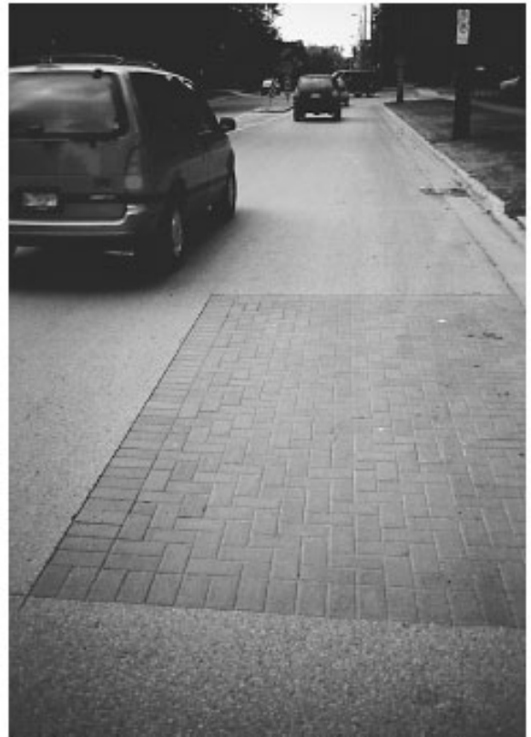
Figure 8. Utility cut repair in a residential area in London, Ontario.