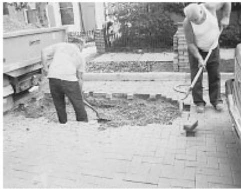
Figure 2. Removal of concrete pavers for a gas line repair in Dayton, Ohio.