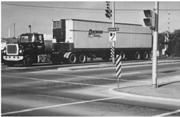
Figure 10. A patch of barely discernible pavers in a heavily trafficked intersection in London, Ontario.