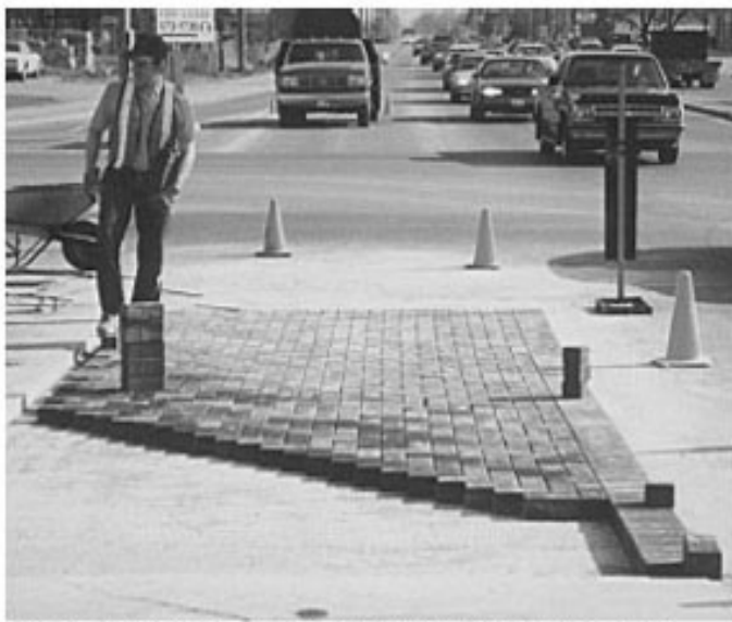
Figure 12. Pavers are laid in a 90 degree herringbone pattern between the border courses.